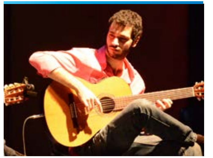
A Syrian youth plays guitar on the World Humanitarian Day 2015

"Accessories, processed food, embroideries, and other items were available for sale. The sale proceeds help women and their respective families to supplement their income in these times of acute economic distress," Issam Habbal, head of Sae'd NGO, said during an exhibitioncum-sale of handicrafts made by 10 women NGO and entrepreneurs based in Damascus.