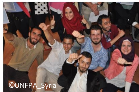
Youth innovation project - Homs

Let's all keep our fingers crossed for them until evaluation phase is finished.