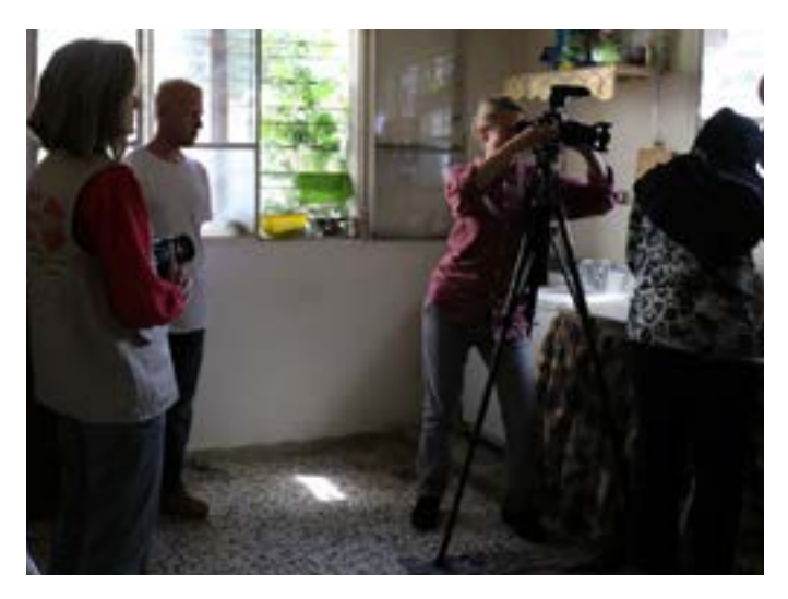
Shooting of a UNFPA video production with a woman beneficiary of the UNFPA-supported women's safe space in Al-Marj, Bekaa, Lebanon.

UNFPA participated in the health sector coordination meeting on monitoring and evaluation. The meeting featured a discussion on coordinating efforts for monitoring and evaluation of the impact of safe spaces and community outreach interventions.