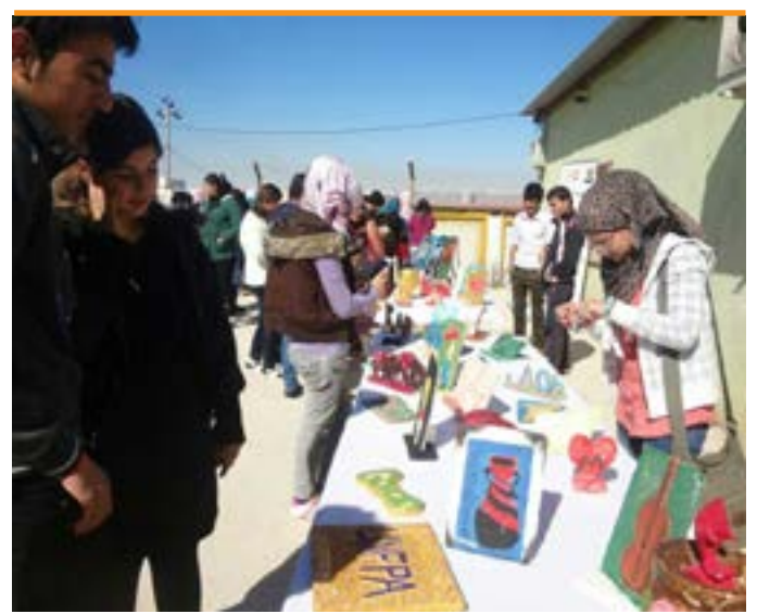
Syrian women participating in a bazar conducted in Domiz camp in Iraq.

UNFPA Site 3 located in District 5 received a storage caravan that will help reduce pressure on activity caravans which were used earlier for storage of needed materials.