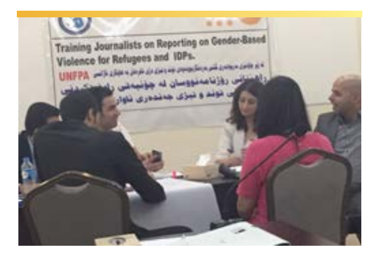
Journalists participating in a training on 'Reporting on gender-based violence in conflict, Erbil, Iraq.

based violence specialized reporters network, which will work to build the capacities of other journalists in the three governorates on the same issue.