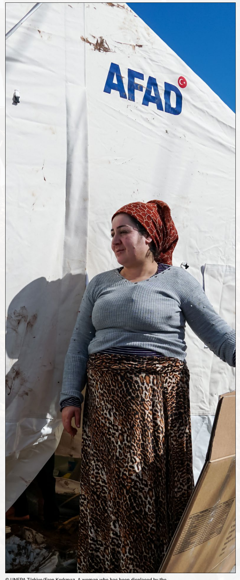
A woman who has been displaced by the earthquake standing outside a tent in a temporary displacement camp in Diyarbakır. She says that when she and her family fled they were unable to take any of their possessions. The day before, UNFPA provided her with a dignity kit, the contents of which she says are very useful.