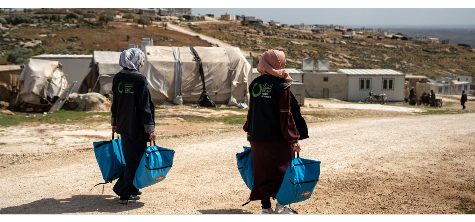
In Sheikh Bahr camp near the town of Armanaz, in the countryside of Idlib, our partner Ihsan in providing women and girls with dignity kits. They include hygiene products for menstruation; cleaning and laundry; warm clothes and blankets; and other items to meet immediate needs.