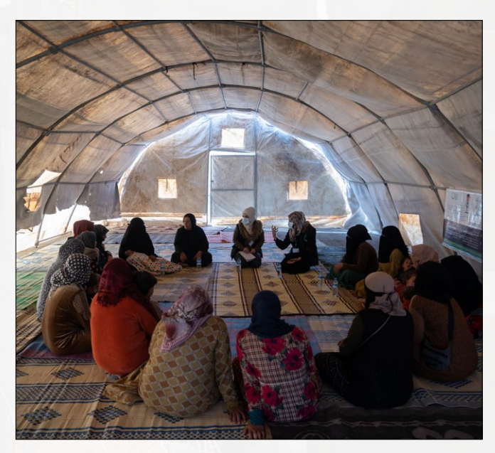
Women and girls are supported by UNFPA's partner, Ihsan, at a session to assess and support women's needs following the earthquakes that affected the region.

which are critical to sustain operations of 182 health