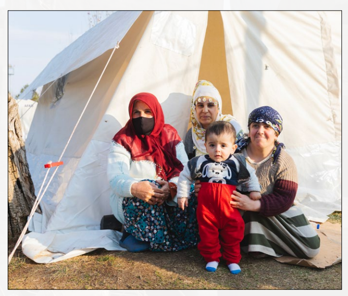
UNFPA and local partners are providing support to women and girls in a temporary camp in Diyarbakır, which has been set up following the earthquakes.

Life-saving reproductive health commodities: UNFPA works to ensure that SRH services and supplies are accessible in service delivery units and carefully monitors their stocks to guarantee uninterrupted delivery of services. Almost 2,000 reproductive health supplies have been provided to affected communities since the onset of the crisis. The first part of a shipment of Inter-Agency Emergency Reproductive Health Kits shipment is under customs clearance.