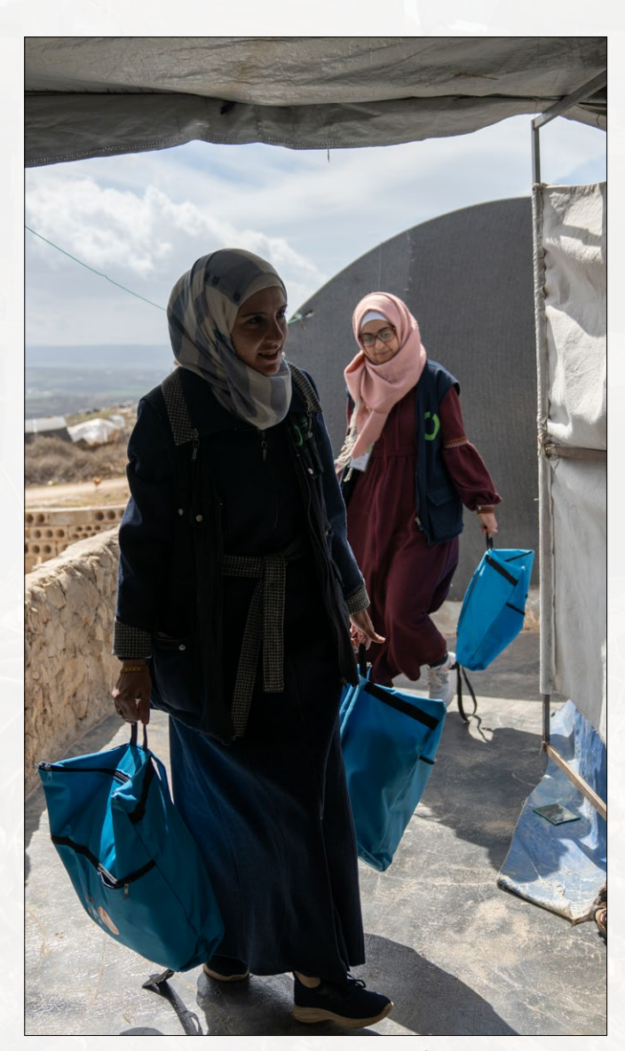
In Sheikh Bahr camp near the town of Armanaz, in the countryside of Idlib, our partner Ihsan in providing women and girls with dignity kits. They include hygiene products for menstruation; cleaning and laundry; warm clothes and blankets; and other items to meet immediate needs.

UNFPA has published this video to highlight the dire needs on the ground and its efforts to ensure no one is left behind. A feature story was also published to mark the passing of 12 years since the onset of the protracted crisis in Syria.