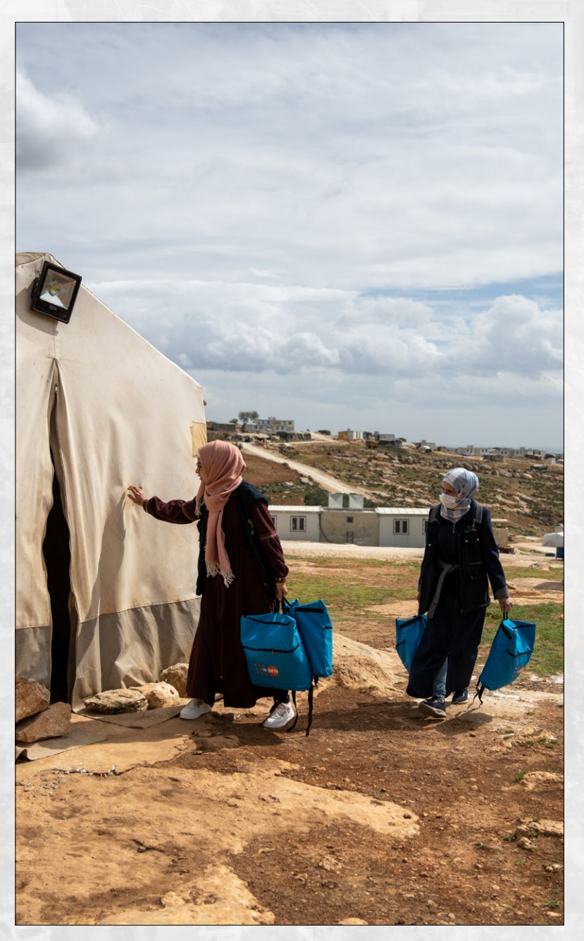
In Sheikh Bahr camp near the town of Armanaz, in the countryside of Idlib, our partner Ihsan in providing women and girls with dignity kits. They include hygiene products for menstruation; cleaning and laundry, warm clothes and blankets; and other items to meet immediate needs.

Damaged health care facilities resulted in a lack of essential lifesaving obstetric and neonatal care services. Increased referral times to functioning hospitals and reduced capacity of trained providers has impacted access to care for both normal and urgent deliveries. This has increased the risks of otherwise preventable maternal morbidity and mortality. Access to comprehensive reproductive health services including family planning has been disrupted which is contributing to increased morbidity and mortality, as well as psychological and mental health distress.